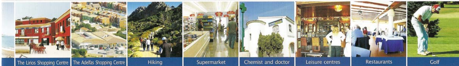
The Lirios Shopping Centre